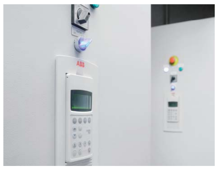
The winch control program inside ABB's ACS800 industrial drive was easily adapted to meet the needs on the m/s Viking Grace.