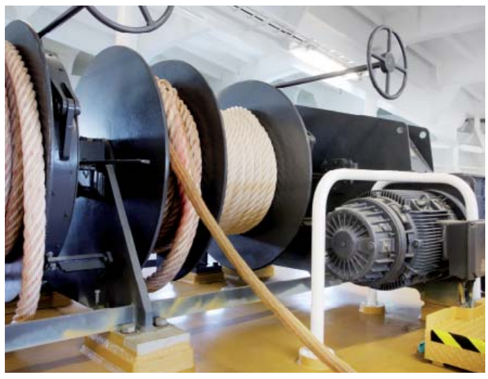
Due to the quick turn-around times in harbor, the ropes are let out and Electrically driven winches were specified instead of hydraulic control.