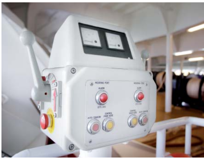
Winch operator controls were easily integrated with the drive's I/O.