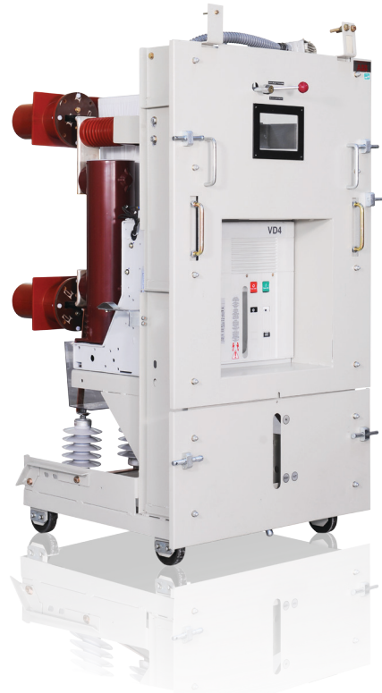
ABB VD4 vacuum retrofit of NGEF/GEC EKV breaker

For more information please contact service department at: