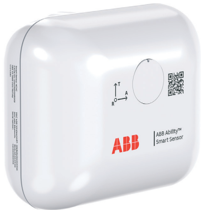
ABB Ability™ Smart Sensor, generation 2 Installation with flat surface mount