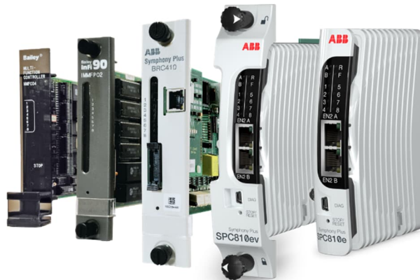
ABB Document Number: CA-LO-SPC-2024

For more information or to download brochures click here .