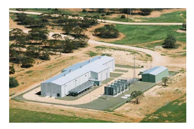
Figure 5 - Berri Converter Station

The Murraylink project consists of two converter stations, one located at Berri in South Australia and the other located in Red Cliffs in Victoria. The DC cables are installed underground for 180km between the converter stations. The project was commenced in 2000 and in operation in 2002.