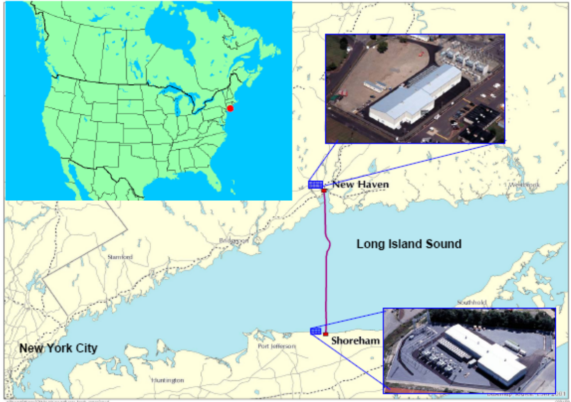
Figure 4 – Geographical location of Cross Sound Cable