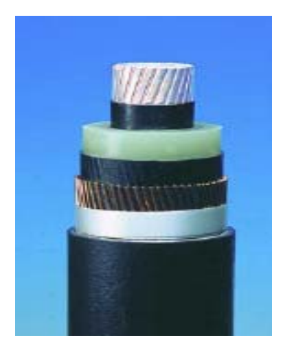
Figure 2 Telescopic view Murraylink cable

with 12 mm insulation thickness enables a fast production process.