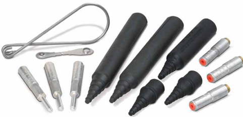
SS1 4 FN 750 K