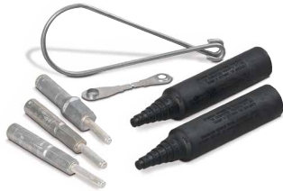
SSP 1/0 FN 500 K