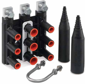
SS 3 K