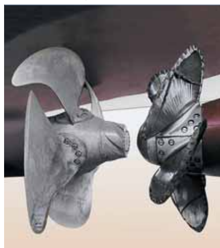
1 Contra-rotating propellers

Having built these first two vessels, MHI can recommend Azipod CRP propulsion both for ferries and for high-day-rate vessels such as LNG (liquid natural gas) carriers, where redundancy is important.