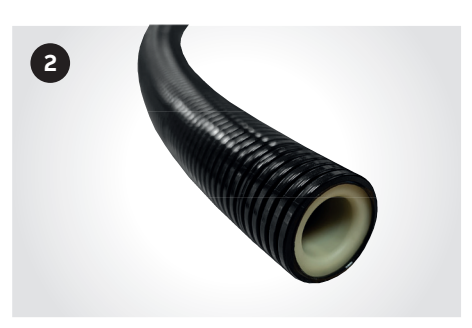
The Multi-Sleeve Adaptor fully inserted, facing into the slit-conduit.