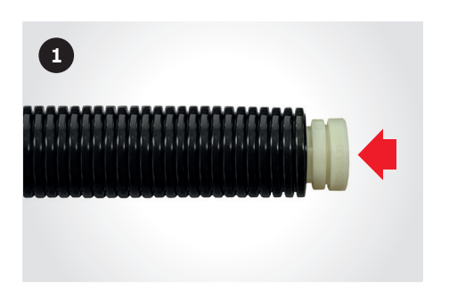
Insert the Multi-Sleeve Adaptor into the Harnessflex® slit-conduit.

Harnessflex® slit-conduit + Multi-Sleeve Adaptor + Connector Interface (backshell).