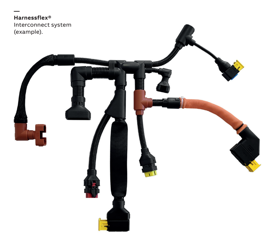
Harnessflex® External Connector Interface + Multi-Sleeve Adaptor.