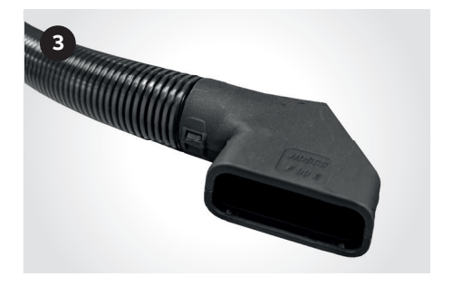
The tensile strength of your slit-conduit to connector backshell connection will now be improved.