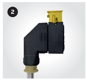
Insert the Multi-Sleeve Adaptor into the Harnessflex® External Connector Interface (protruding outwards), feed the wiring through the Adaptor, then close the hinged fitting.