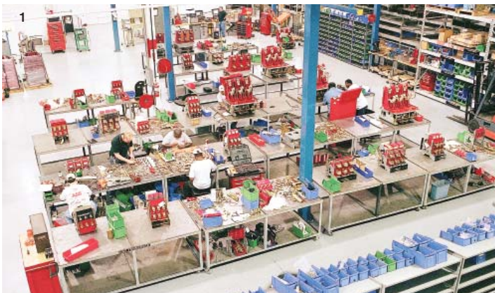
1 ABB has dedicated resources to professionally repair and refurbish all low and medium voltage circuit breakers to like new operating condition, in a controlled factory environment | 2 ABB field service technicians are factory trained and equipped to support power plant, substation or industrial installations

The Low and Medium Voltage Service factory-trained technicians offer comprehensive field maintenance and repair services for planned and emergency work, 24 hours a day, 365 days a year. Service personnel have direct contact with the Low and Medium Voltage Service factory for authentic parts, original equipment drawings and technical support. Services include switchgear and circuit breaker commissioning, inspection, testing and refurbishment; replacement of breakers, relays and control components; primary bus upgrades and related switchgear services. ABB also offers maintenance and repair training, from product orientation for new equipment, to advanced repairs and life extension.