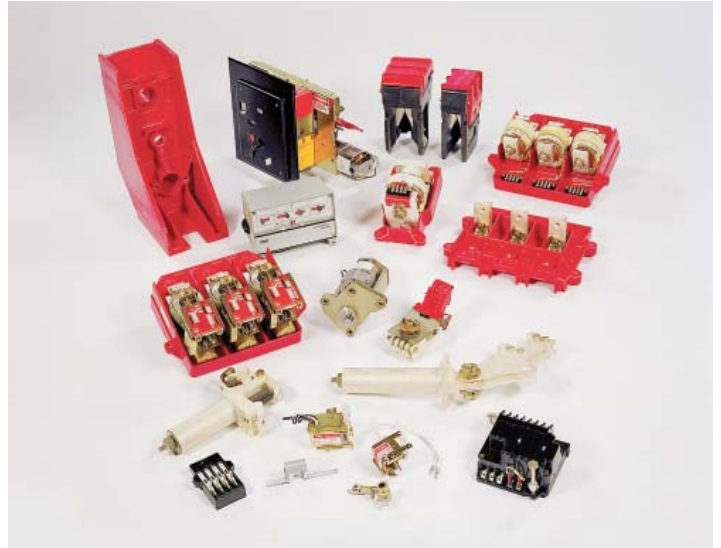
Low and Medium Voltage Service supplies replacement components for the full line of ABB switchgear products

A customer that purchases switchgear or distribution breakers from ABB is assured of continued, responsive support, long after the equipment has been energized.