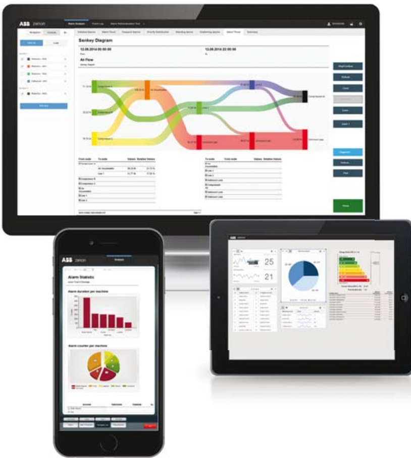
ABB zenon IoT software Information | Integrity | Insight

From machinery to warehouse: machine HMI, factory supervision, control, data acquisition, scheduling and performance reporting.