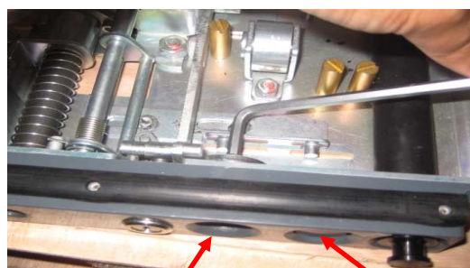
Figure 1 Dummy Lock Knockout