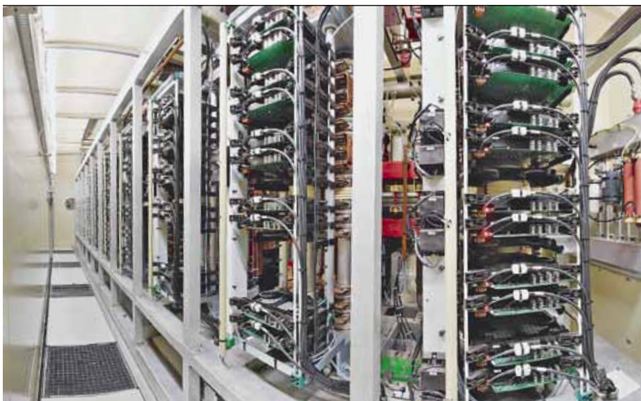
6 PCS 8000 AC Excitation IGCT converter arrangement inside the container