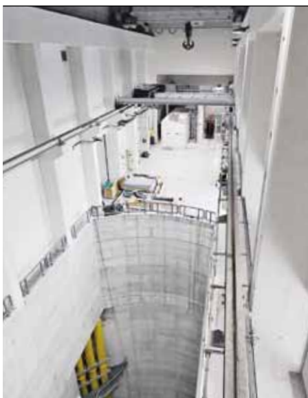
4 View inside the power house with the ABB PCS 8000 AC Excitation system