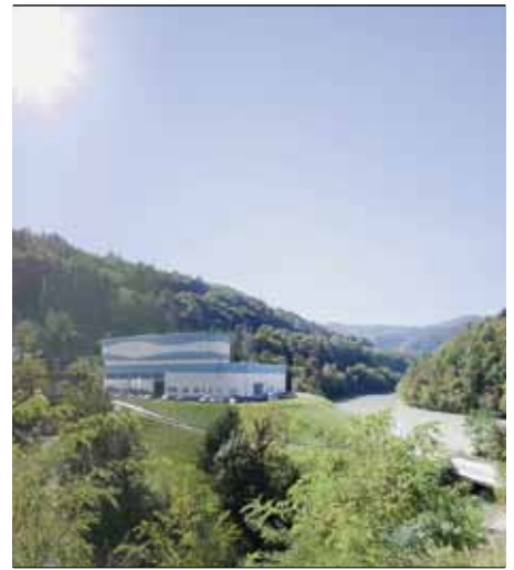
1 The Avče power house located on the Soca river side, looking over the lower reservoir

tion range during pump and generation periods, with an improvement of the pump-turbine cycle efficiency of up to more than 77 percent at the Avče pumped storage power plant.