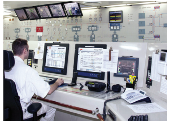
— Tekomar XPERT control room

Almost 1,500 vessels already benefit from Tekomar XPERT 3.0. Find out more about how to give your fleet the advantage too at xpert3.tekomar.com