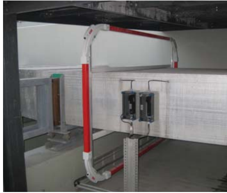
Fig 5 ABB FOCS installed at Qatalum

After conducting detailed rectifier design studies and type tests on ABB's standard rectifier design used for many years, only minimal alterations were required to make the design suitable for this HV DC application. The Qatalum rectifier frame