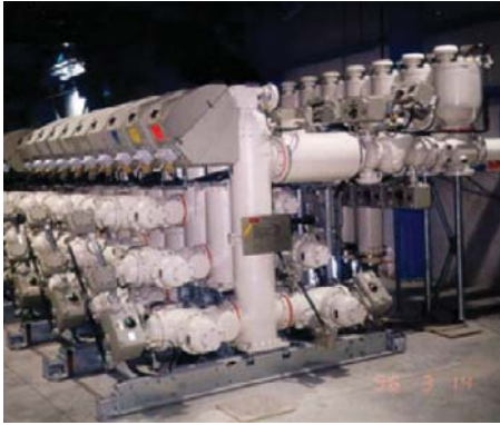
Fig 4 ABB's ELK-14, 300KV GIS switchgear

controls and protection is normally a demanding task for the EPCM's engineers, ending up in a long lasting painful exercise. At Qatalum the GIS controls and protection as well as the rectifier control system was supplied by ABB Switzerland allowing a seamless interface.