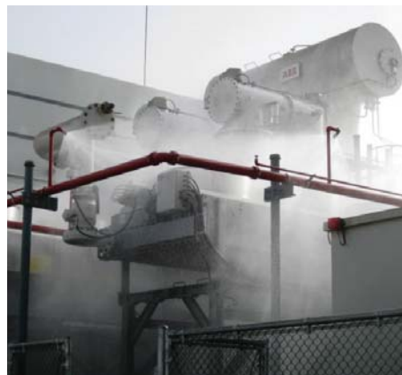
Fig 2 Rectifier bay during fire fighting system testing