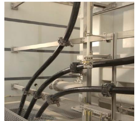
Fig 3 220kV Cable connection to the Regulation Transformer