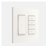
ABB-free@home™ smart home system ABB-free@home isn't just another smart home solution. It's smarter than smart. Smarter than complicated installations, one-function devices and automation solutions that don't work together. It performs elaborate functions with ease and simplicity, making the home safer, more comfortable and more enjoyable. Learn more at abb.com/freathome .

For more than a century, electricians have relied on the trusted brands of ABB Installation Products* — brands like Carlon®, Catamount® and Red•Dot®. You can still count on those same brands for the quality, innovation and performance you need to get the job done right. Plus, now you can combine them with innovative new residential solutions featuring the latest technology from ABB — all available from the same single source you know and trust.