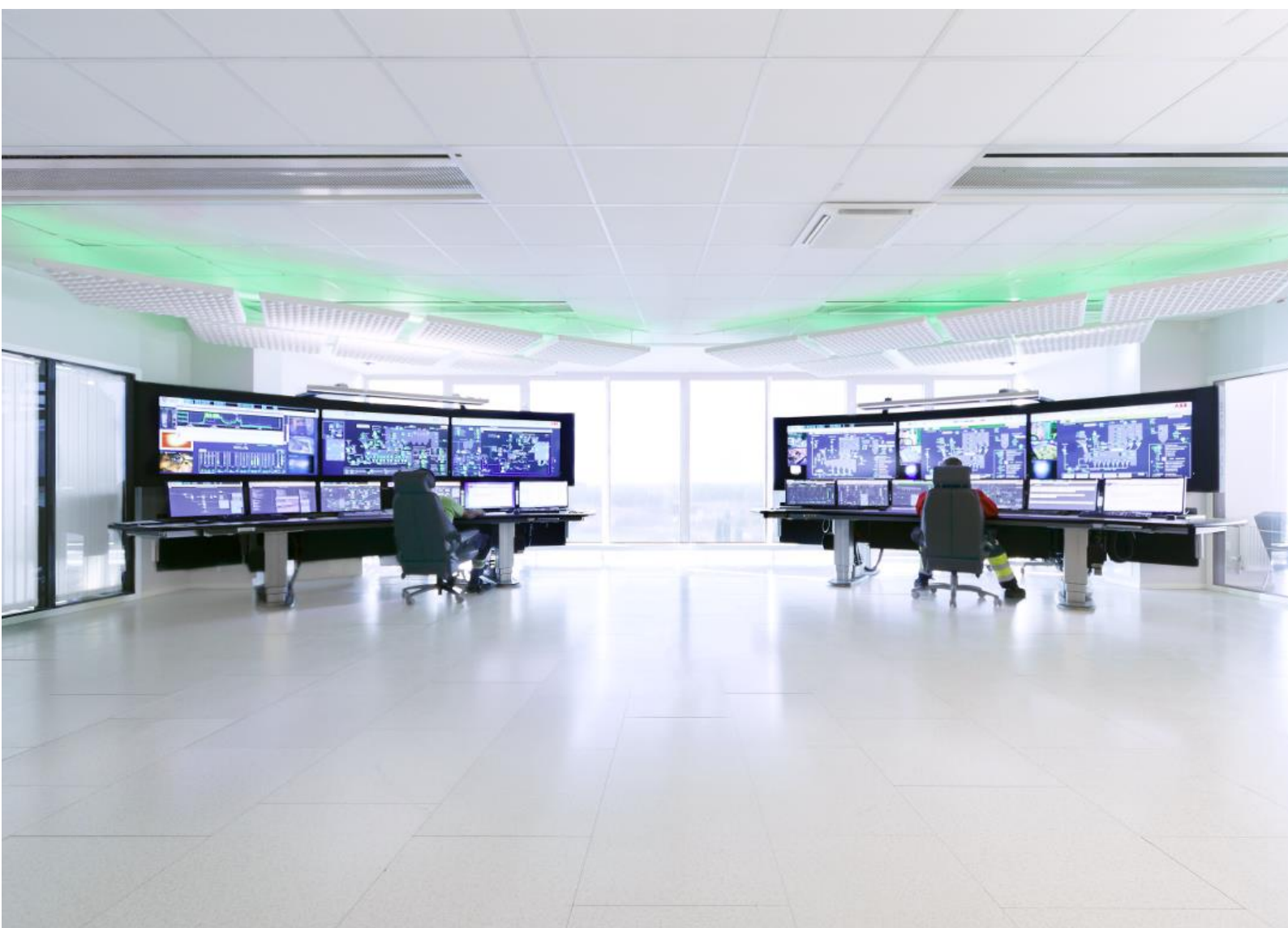
ABB Ability™ System 800xA Safety Systems Learning Path