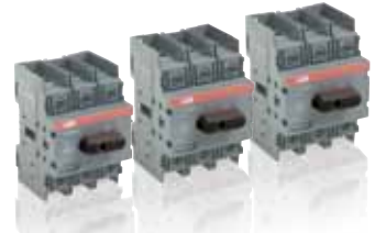
OT30F3 OT60F3 OT100F3