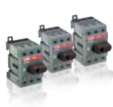
OT16F3 OT25F3 OT40F3