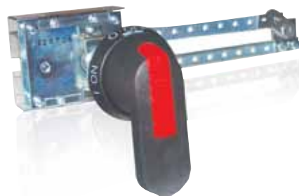
Double throw mechanism