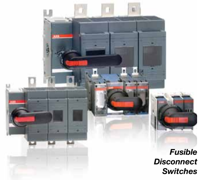
Fusible Disconnect Switches