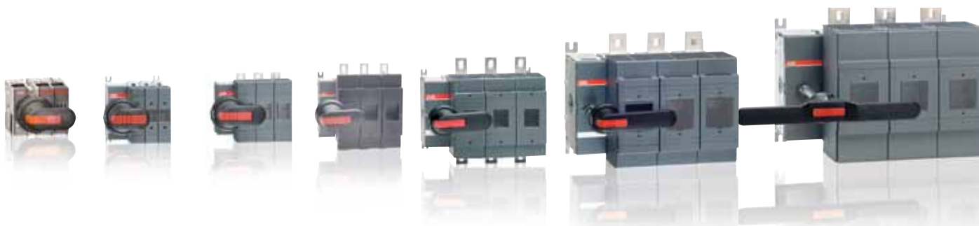
OS30FA_12 OS060GJ03 OS100GJ03 OS200J03 OS400J03 OS600J03 / OS800L03 OS1200L03