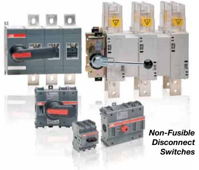
Non-Fusible Disconnect Switches

Positive opening operation safeguards users in case of welded contacts due to an extreme overcurrent situation. The ABB switch design cannot reach the OFF position unless the contacts are truly open. This safeguards the user by alerting them of the problem, maintains door interlock safety and does not allow a padlock to be inserted.