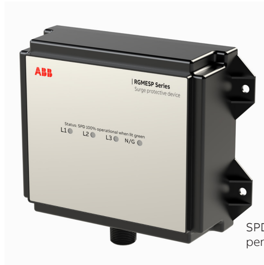
SPD, 80 & 100 kA per mode

The ReliaGear® RGMESP Series offers robust surge protection with an emphasis on performance, safe operation, and user-friendly diagnostics.