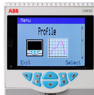
ControlMaster CM30 universal controller

Profile control enables setpoint profiling for thermal processing applications. Two versions are available; a basic single program version and an advanced, multi-program version with sequencing.