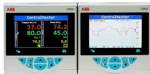
ControlMaster CM30 (1/4 DIN) universal controllers

ControlMaster is packed with features that enables it to handle any application from basic through to complex control applications. Features include math, totalization and a frequency input, logic, gain scheduling, split output, cascade control, valve control and real-time alarms.