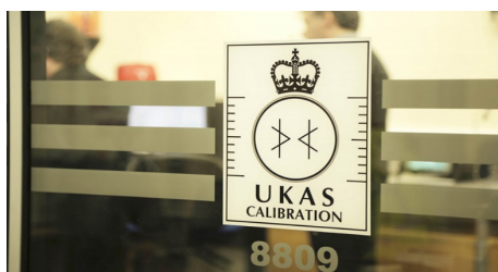
ABB and W H Good partnership

ABB Measurement & Analytics in the UK have a long and established relationship with W H Good Automation Ltd.