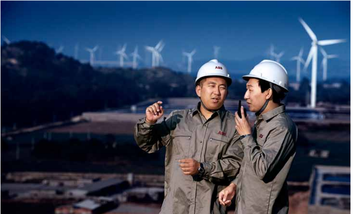
ABB is your best partner for ensuring a long and reliable life to your wind assets minimizing the Levelized Cost of Energy (LCOE) based on proven experience and expertise.

The future of your low voltage equipment depends on the service provided since installation. ABB helps you to understand the importance of choosing the appropriate service strategy for your wind farms and all of its components. We have the expertise and experience to help you find and implement the right service for your devices at the right time, ensuring optimal performance of wind assets. ABB will guide you and support you throughout the entire lifetime of your low voltage products.