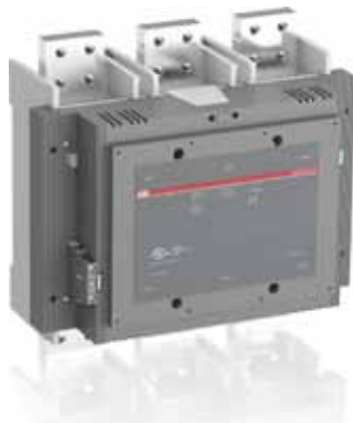
ABB yearly informs its customers of any product's phase out giving information about Last buy date. Any update can be found visiting the Replacement Page in ABB Low Voltage Circuit Breakers WEB site.

For each Low Voltage Products ABB defines the Product Life Cycle Management model (LCM) from the development to aftersales services, aimed at providing proactive services for maximizing availability and performances. The model divides a product's life cycle into four phases: Active, Classic, Limited and Obsolete.