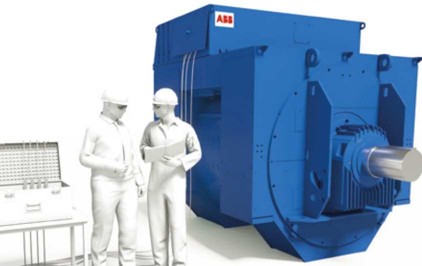
ABB Ability™ Predictive Maintenance optimizes the maintenance of high-voltage diesel and gas engine generators. Taking a condition-based approach, it combines customer input with advanced analytical techniques to create the optimal condition monitoring and maintenance program. This ensures that the right service actions are taken at the right time and for the right reasons.