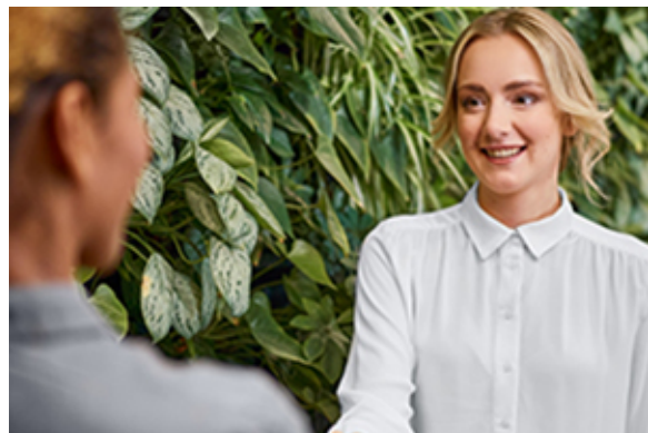
ABB launches Hoisting Young Engineer Exchange Program to attract the next generation of engineer-ing graduates to a career in mine hoisting and bridge the industry skills gap. Read more