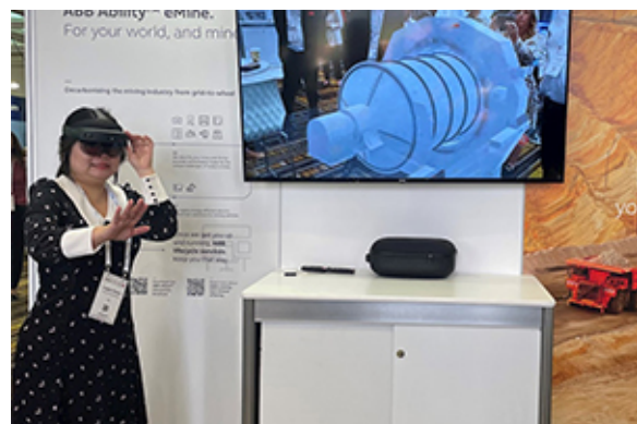
ABB was at Future of Mining (Perth) discussing the pressure to deliver minerals for the energy transition and taking a closer look at the ABB and Gold Fields collaboration. Read more