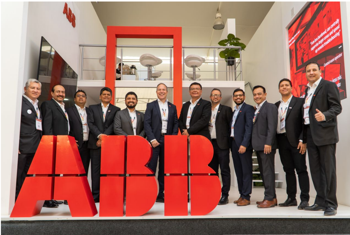
ABB at Perumin, Latin America's No1 Mining Event

ABB was at Perumin to show how we are making a world of difference in mining through our integrated portfolio of automation, electrification, digital, grinding, material handling and hoisting solutions. Watch the video below to see how we showed our solutions through immersive virtual and augmented reality experiences. See more