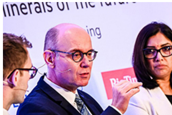
ABB at Future of Mining, Perth, 2023

ABB was Associate Sponsor of the FT Mining Summit (London) in October. Global mining leaders set the industry's agenda and debated challenges for the "Minerals of the Future". See more