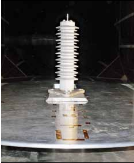
1 Test setup of surge arrester type POLIM-H 33N in one of the wind tunnels of the German Aerospace Center DLR