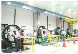
Robotics & Motion