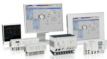
ABB Ability™ Control Technologies