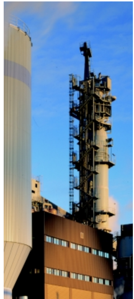
Digester – Kymmene mill Finland