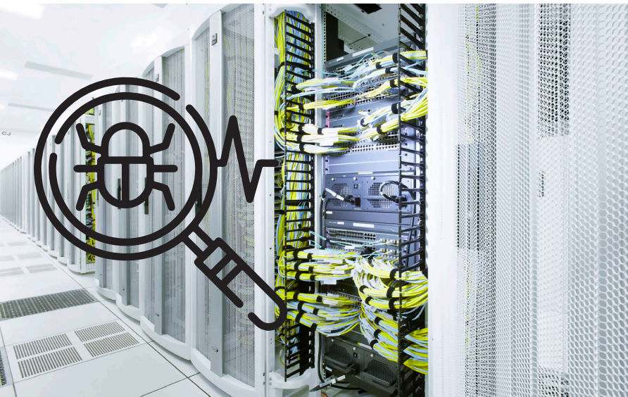
ABB Ability™ Malware Protection Management Effective protection against malware

For years, virus and malware infections of computers have been one of the biggest security threats for control systems.