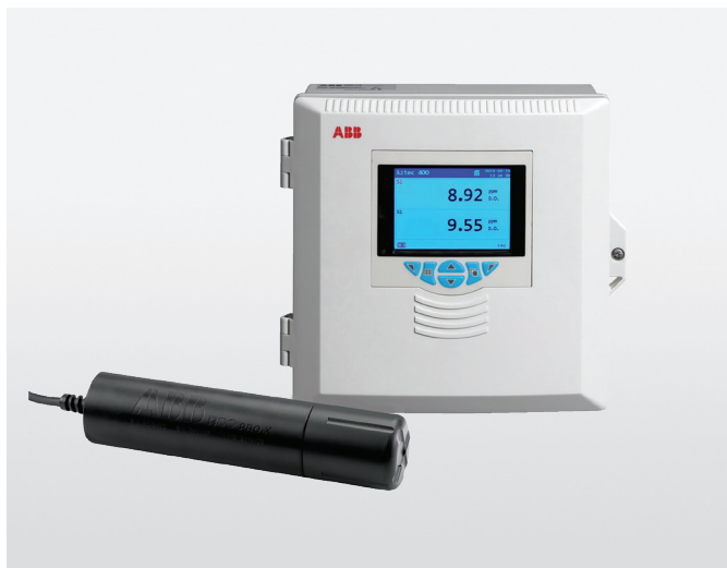
ABB's ADS430 and AWT440 transmitter.

ABB's Aztec 400 range of advanced digital sensors are designed for monitoring the key parameters in municipal and industrial water and wastewater treatment. Using Rugged Dissolved Oxygen (RDO®) optical technology, the ADS430 can provide accurate measurement of dissolved oxygen in the most demanding process environments, including high saline applications. The robust construction resists abrasion and photobleaching effects that limit the lifetime of other optical DO sensors.