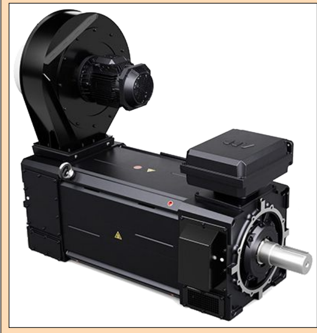
Figure 1 - a full range of machinery motors is optimized for high power density

Water cooled solutions can also be specified. These guarantee a perfect seal, ensuring the motor's internals are not exposed to carbon dust that might cause wear or failure. They also cool down the motor much more efficiently than air, enabling a further increase in power density over regular air cooled HDP motors. The water jacket also reduces the noise coming from the motor to create a more pleasant work environment.