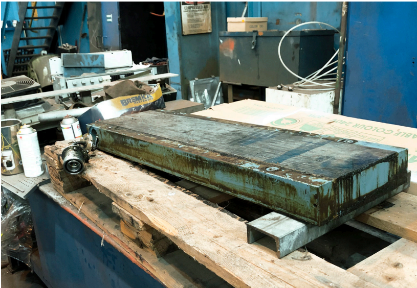
Roll force load cell