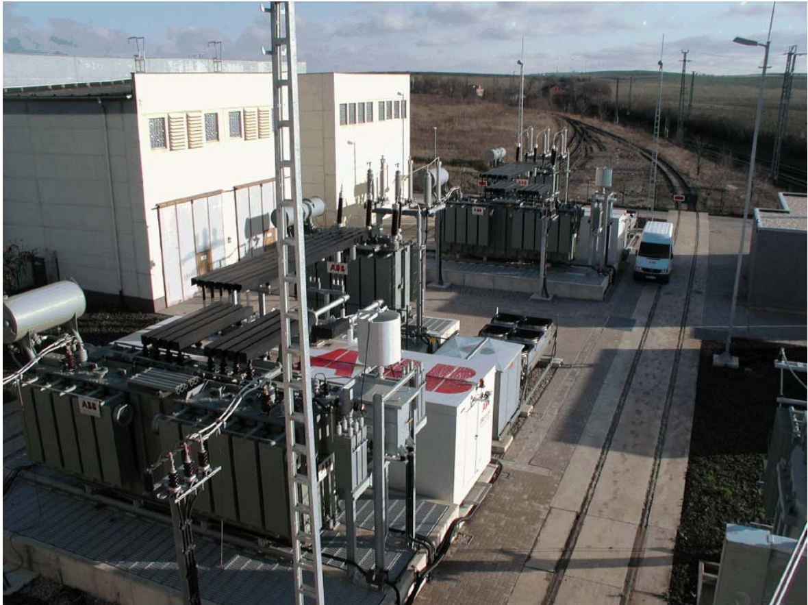
ABB 15 – MW - Standard Converter – 2 Units 3AC 110 kV 50 Hz – 2AC 15 kV 16,7 Hz 37,8 MVA / 30 MW