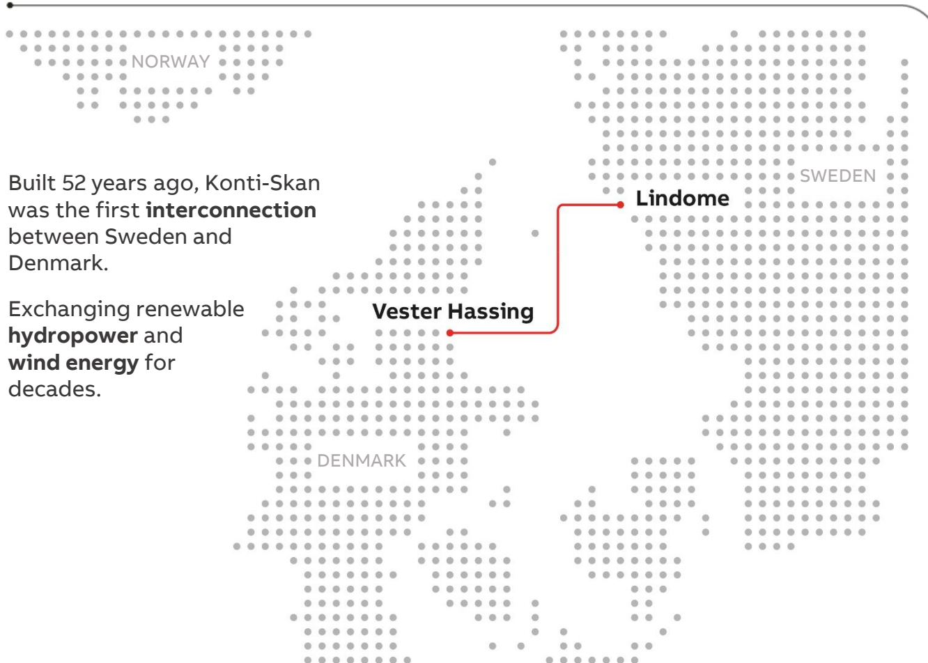
ABB Ability™ MACH™ – enhancing power reliability and control

Built 52 years ago, Konti-Skan was the first interconnection between Sweden and Denmark.