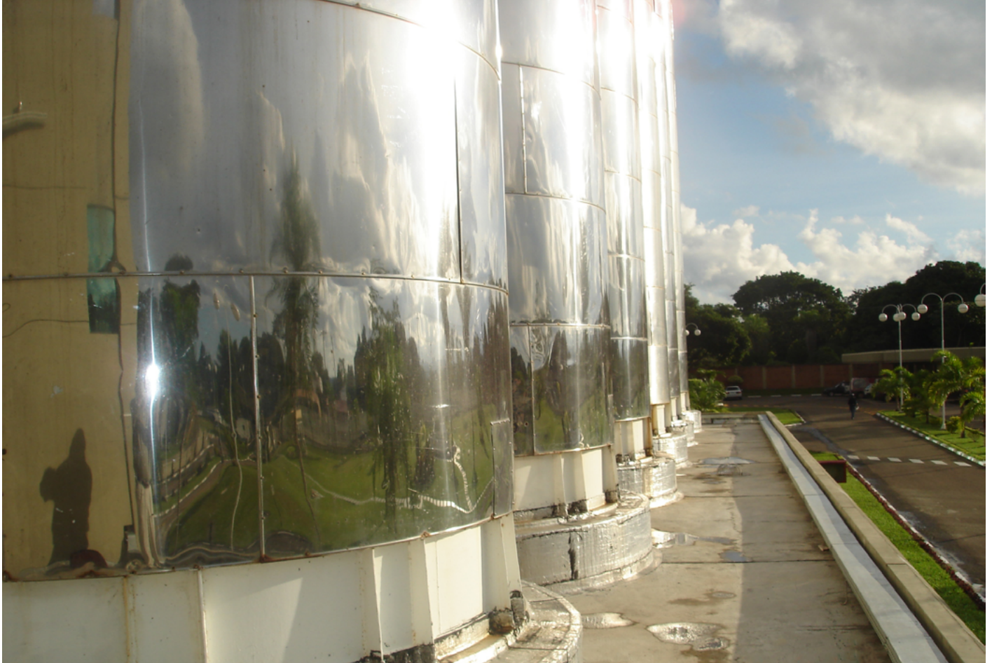
External view of fermentors

A measure of success as a business lies not only on the quality of the beer, but also on the contribution to the community and environment.