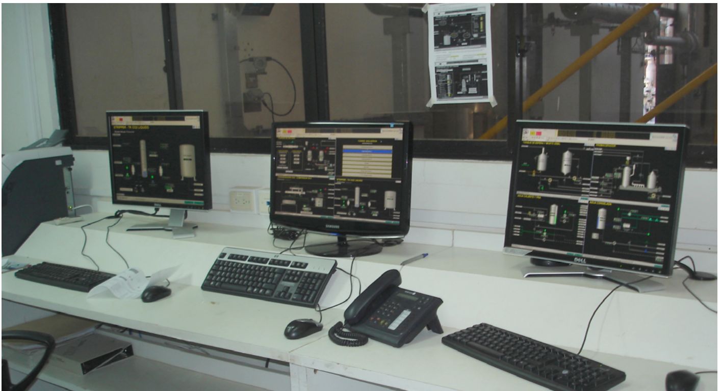
Workstations at brewhouse control room