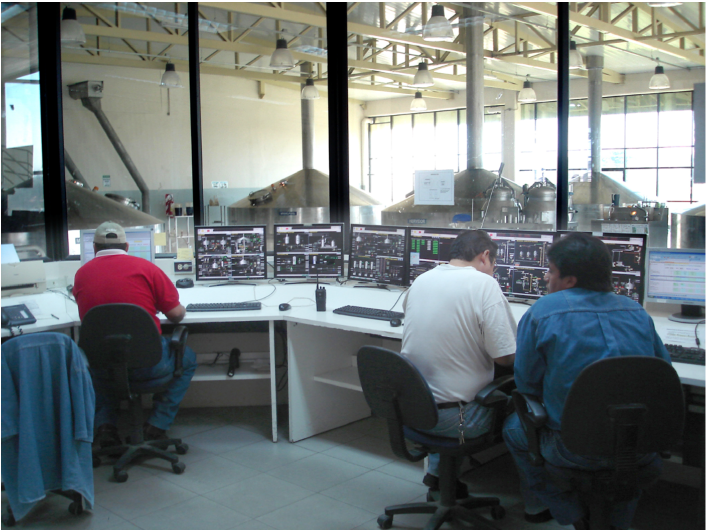
Brewhouse control room