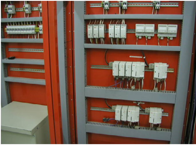
Brewhouse control board