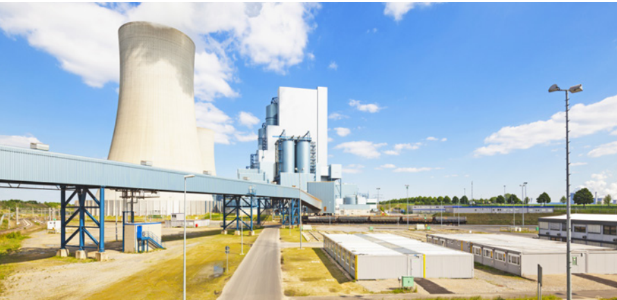
ABB deliver human factors benefits to SSE's control rooms.

In light of recent major incidents across the process industries, SSE had identified a need, as part of its Process Safety Management (PSM) programme, to assess its current control room operations.