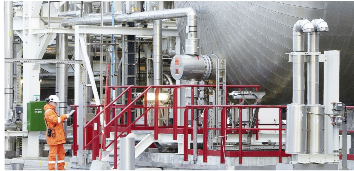
ABB Automation GmbH Measurement & Analytics Stierstädter Straße 5 60488 Frankfurt am Main Germany Fax: +49 69 7930-4566 Mail: cga@de.abb.com abb.com/measurement

Uras26 for trouble-free continuous measurement of carbon dioxide and carbon monoxide after the catalytic reformer reaction.