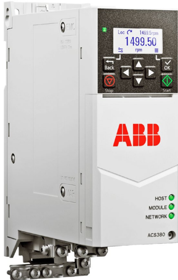
ABB machinery drives ACS380, 0.25 to 22 kW

Thanks to its reliable performance and ease of integration, the ACS380 is an all-compatible machinery drive ideal for machine building.