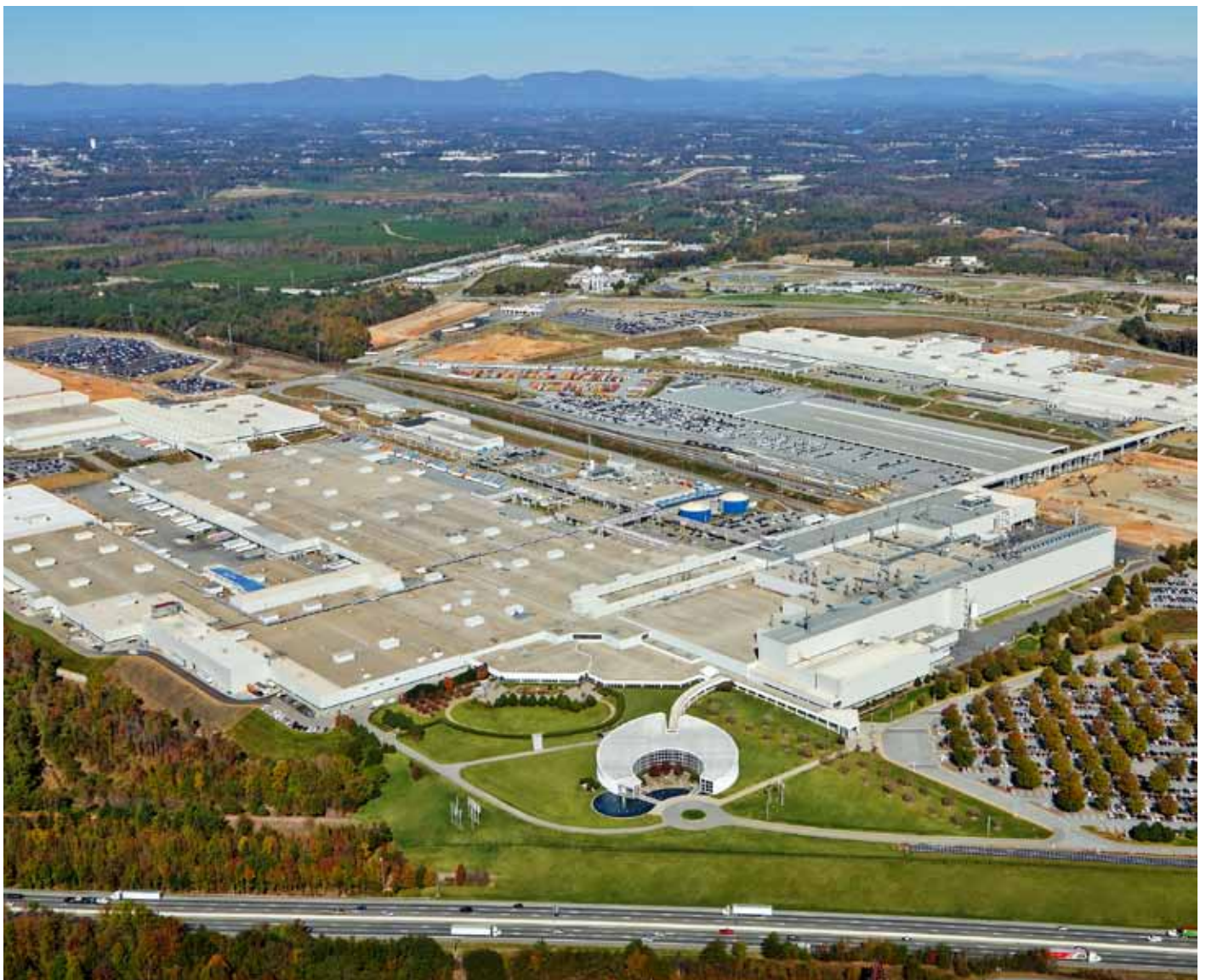
The BMW Spartanburg production plant in South Carolina.