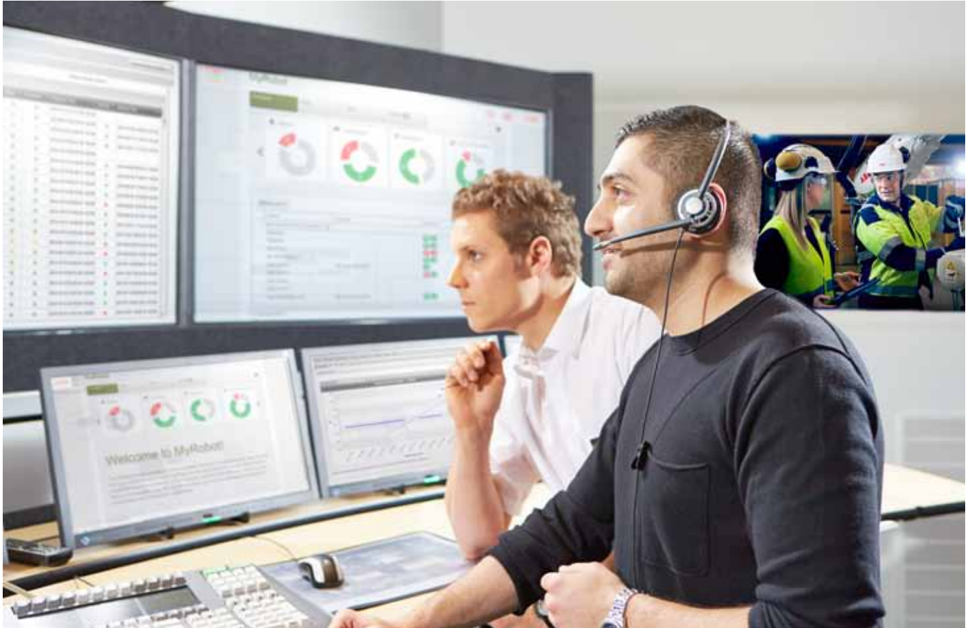
Remote Service - predictive, proactive and immediate support.