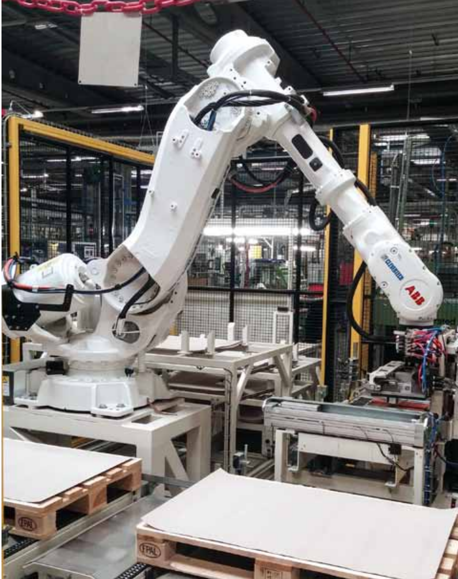
An ABB robot IRB 6640 at Deufol's Packaging and Logistics Center.

“Scheduled inspections and remedial action by ABB specialists to keep our equipment in top condition reduces the risk of unplanned stops.”