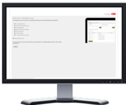
During 2015 MyRobot will be available on the MyABB Customer Portal for all customers that have Remote Service.

As customers begin to move away from the “break and fix” philosophy of service and toward a predictive, proactive, and immediate support mindset enabled by the Internet of Things, conventional customer service doesn’t make sense to support these highly connected customers’ needs (see the article on pages 12-14 for more on the Internet of Things).