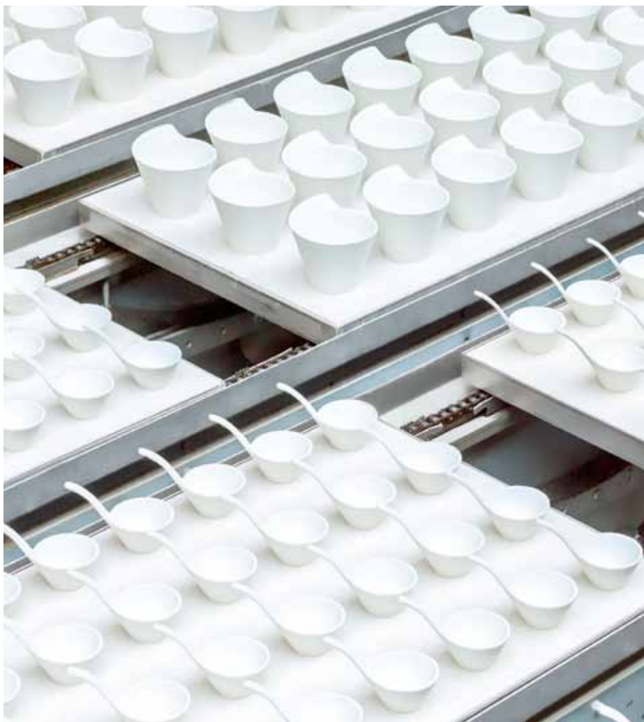
High pressure die casting at Villeroy & Boch.

To ensure high uptime and maximized production of the line, Villeroy & Boch re-