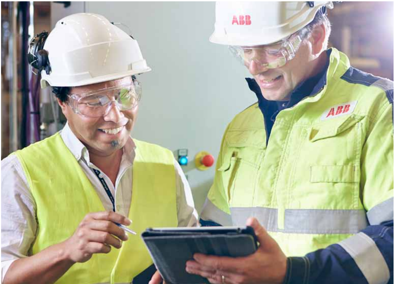
ABB Robotics Customer Service. Securing your productivity. Anytime. Anywhere.

With more than 250,000 robots sold worldwide, we know how to provide world-class service for robots and robot equipment. Our 100 service locations in 53 countries around the globe mean that we are always nearby. And thanks to 1,300 dedicated specialists, you get fast issue resolution and local support at the right time. We have the deep competency to support your needs, and original spare parts available for 24/7 delivery, so your operations can keep on running. If you want to maximize equipment lifetime and secure your productivity, please visit www.abb.com/robotics