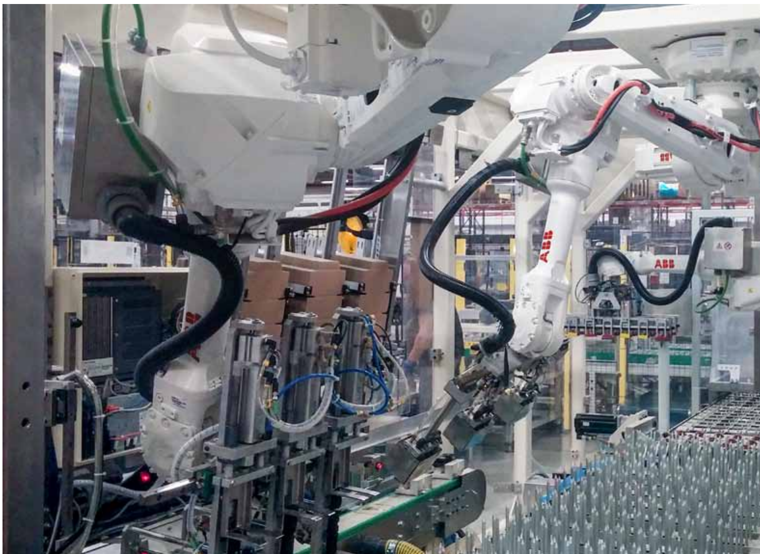
Avoiding unplanned stops is a key feature of Remote Service.