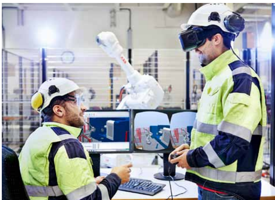
With Remote Service up to 50 percent of unplanned stops can be prevented.

“Let me put it this way,” says Nispeling, “to supply a robot to a customer is one thing, but to have a device that produces all the time for a customer is another thing entirely.”