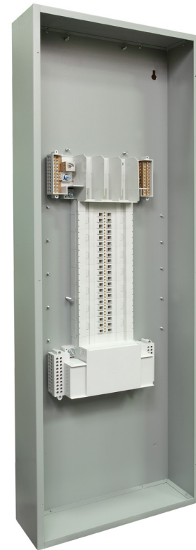
Nema 1 Enclosed Panelboard