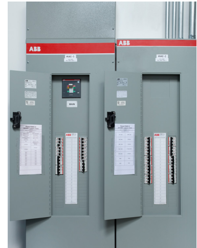
ProLine Panelboard installed in the VPP rated ABB, New Berlin facility

The ABB New Berlin facility is an example to manufacturing facilities worldwide that productive and efficient operations can go hand-in-hand with worker safety.