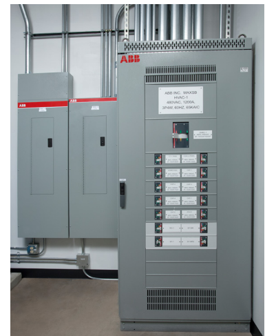
ABB ProLine Panelboard

To Learn More about the Voluntary Protection Program (VPP): CLICK HERE