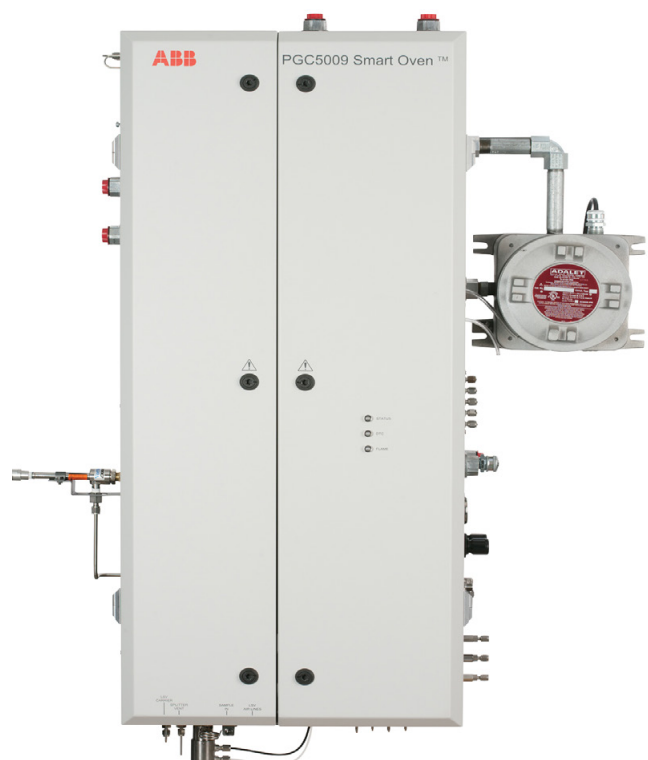
The PGC5009 fast gas chromatograph

The separation of components and products in a refinery is mostly done by distillation columns. To maintain profitability it is important to have good distillation control, which is only possible by using analyzers that quickly respond to compositional changes. The PGC5009 uniquely provides the fast and repeatable measurements needed to implement tight control strategies that improve margins.