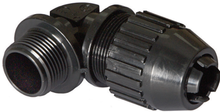
ABB cable glands – NBBG-R90 series Black Beauty ® general purpose nylon cable glands

Ideal for all industrial OEM and MRO applications, hand tighten, high mechanical pull out performance.