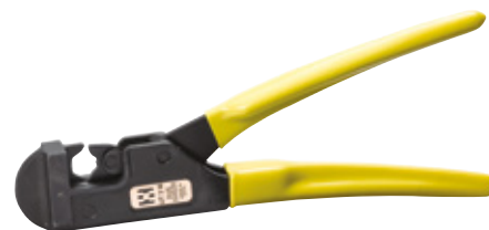
UT 3 M Installation tool

The Radiating Rib™ design of the RRK aluminum splice helps to dissipate heat to allow connectors to be smaller. Up to 4/0 AWG size can be installed with a small, one-handed tool.