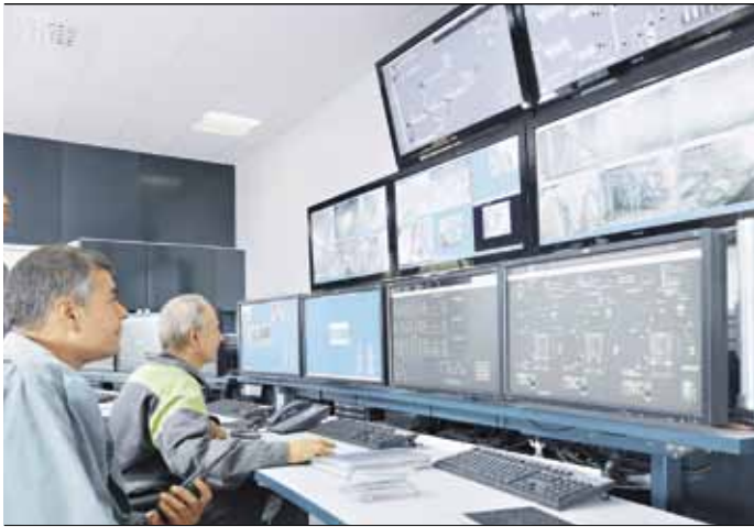
ABB's Extended Automation System 800xA controls the entire plant and each piece of equipment throughout the mine.

Aitik is the world's first installation to integrate not only the maintenance system but also the document management system with System 800xA. This gives operators fast and easy access to correct instructions, drawings, etc., and enables quick and accurate decisions and actions. In March 2011, Aitik also began using System 800xA asset monitors as a means to achieve predictive maintenance, focusing on three critical parts of