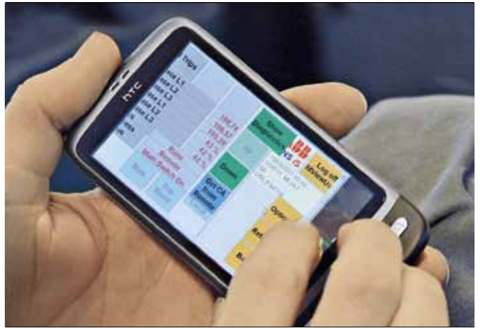
Soon, engineers, operators, supervisors and the like will each have their own HTC smartphones to supervise and control the plant.

A reliable and dependable energy supply is vital for the functioning of any industry. Managing and controlling this supply is thus as important as managing and controlling any other significant process parameter. At Aitik this means that the incoming power is visible in System 800xA. The operators have a complete overview of the entire plant and can immediately make adjustments if there are disturbances to the incoming power.