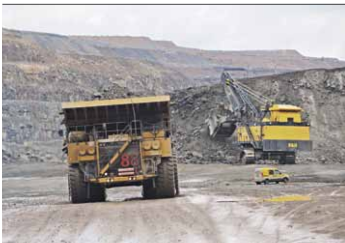
3 Massive, 100 ton trucks with wheels 3.4 m high are used to carry 200 ton loads to the crusher inside the pit at Aitik.