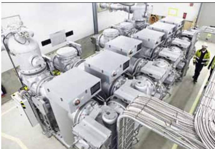
5 ABB's 170 kV gas-insulated switchgear distributes electric power to the mine.