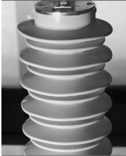
2 Silicone housing of surge arrester type POLIM-H 33 during the test with 100 m/s (360 km/h) airflow

on their products, for example by masking roof-mounted equipment.