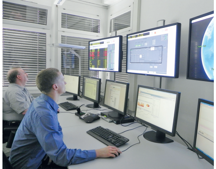
ABB experts are always available by connecting to the plant from our remote monitoring room.