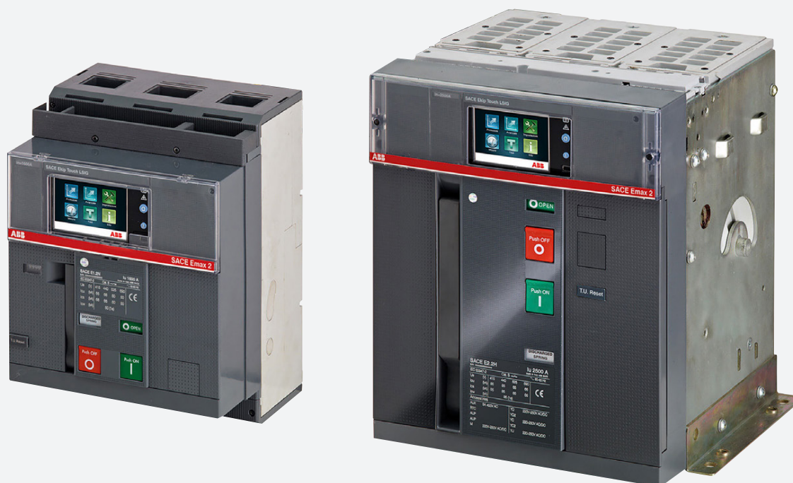
ABB Ability™ Electrification solutions Smart breaker retrofit