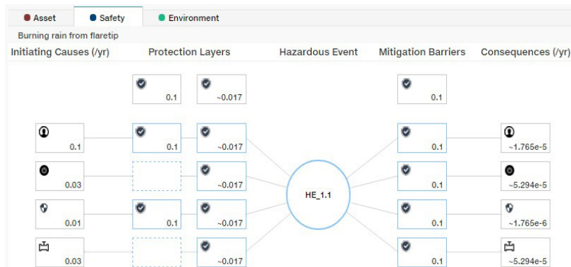
ABB SafetyInsight™ risk assessment modules guides' oil, gas and chemical companies through the hazard and risk assessments required by this high hazard industry and keeps these assessments evergreen.

Companies operating high hazard processes need to be able to answer the following three questions: