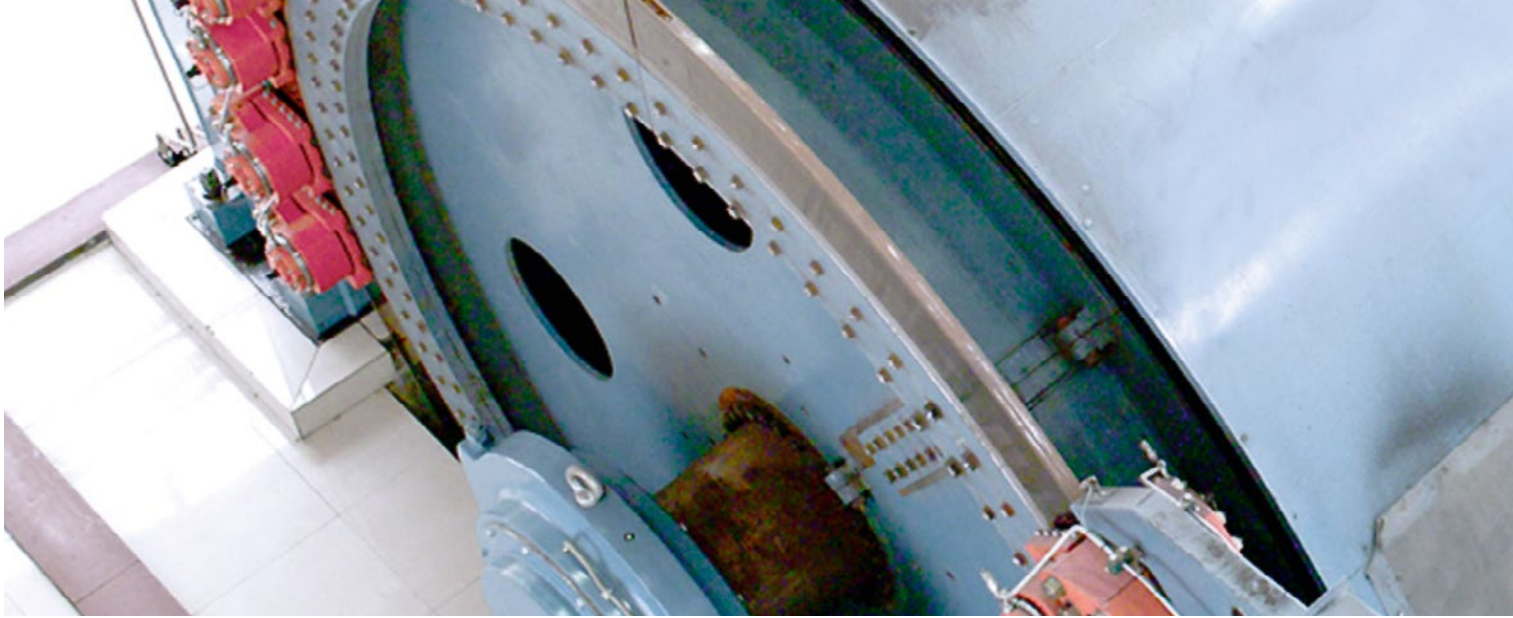
ABB delivered its first complete mine hoist in 1937. Since then, more than 700 units have been installed all over the world. Thanks to our global presence and long-lasting experience we provide services tailored to your needs — on site or remotely.

ABB offers mine hoist services for condition and performance control to maintain the equipment in “as commissioned” state. We have the unique capability to engineer, deliver, install and provide service for entire mechanical and electrical mine hoist systems of all types — friction hoists, single- and double-drum hoists.