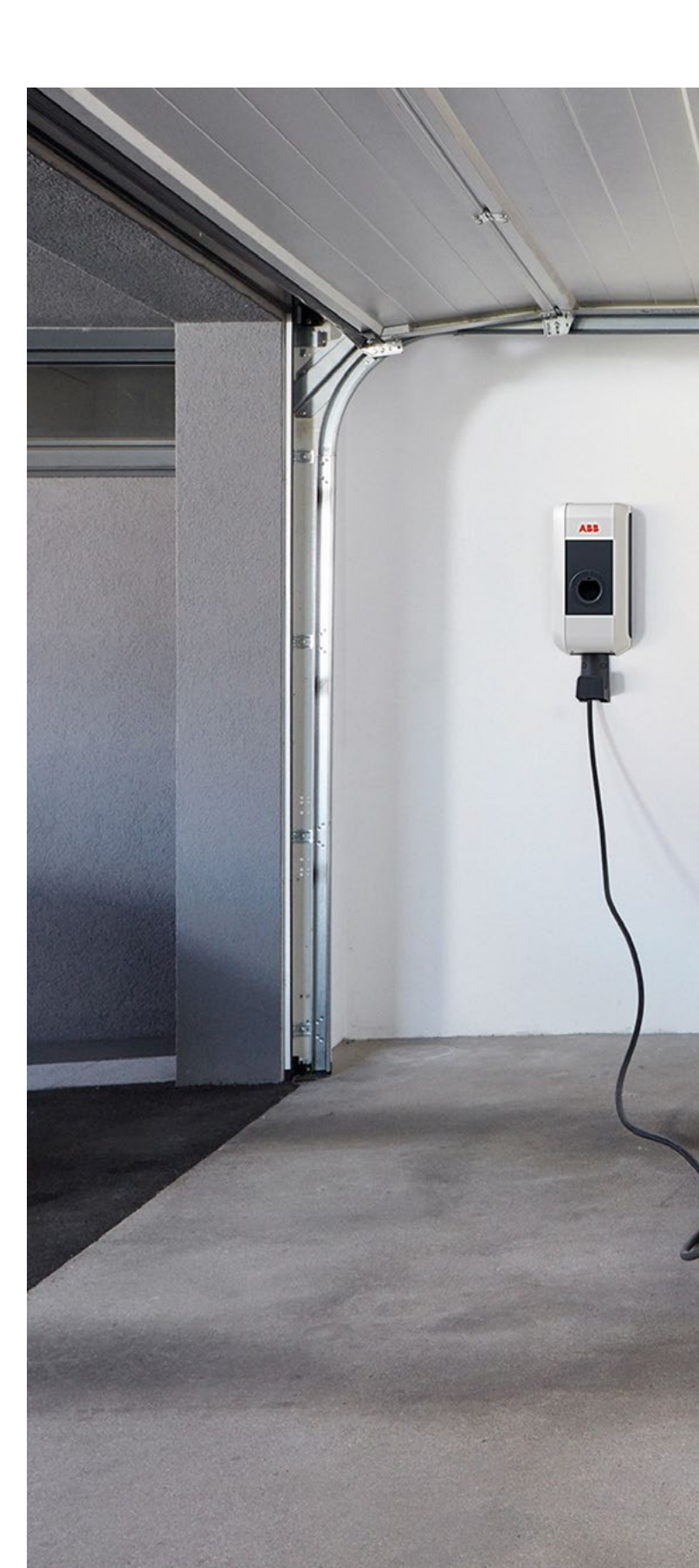
abb.com/ev-charging Available immediately