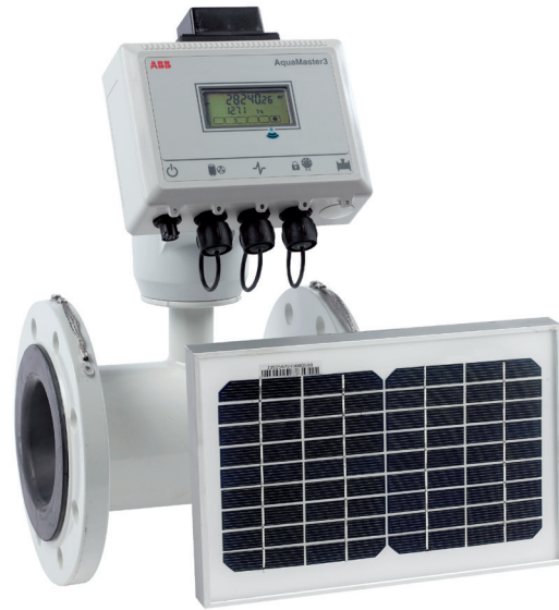
Enabling accurate flow measurement for pricing and allocation, ABB's AquaMaster 3 electromagnetic flowmeter offers the ideal solution for irrigation applications.

With the introduction of a renewable energy option, the AquaMaster can be installed in even the remotest locations. Adding to the existing battery and mains-powered versions, it can be hooked up to sources as small as a 5 Watt solar panel or a 60 Watt wind turbine generator.