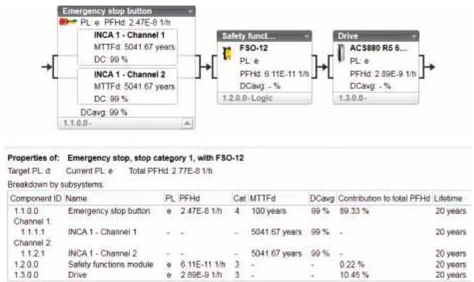
Figure 3: Safety calculation and design for the emergency stop function according to EN ISO 13849-1 (can also be made according to EN/IEC 62061). The design is made with the Functional safety design tool.

1. Evaluate the risks to establish target safety performance (SIL/PL level) for the safety function.