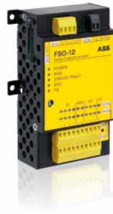
Safety functions module, FSO-12