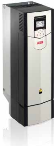
ACS880-01 R5 drive