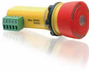
INCA 1 emergency stop button