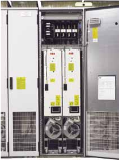
ABB ACS800 drives module.

drives. The higher overall availability of the dragline with an AC drive system will provide significant productivity improvements to the mine operation and the operating cost of the machine.