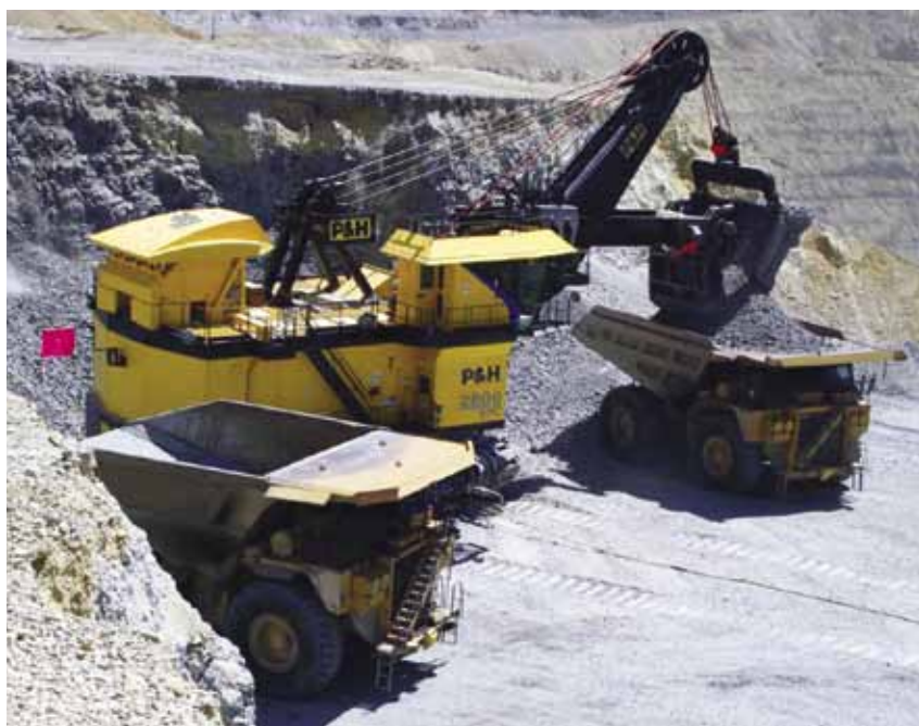
Electric rope shovel operating with ABB ACS800 multi-drive.

For draglines, motor-generator sets have been the most popular drive systems and new draglines are still delivered with motor-generator sets. The majority of the operational draglines were built between 1960 and 1990, with Ward-Leonard motor-generator sets and DC motion motors. New draglines are now offered with conventional or gearless AC drive systems. The advantages with new motion drive solutions are almost maintenance-free AC motors, and higher efficiency of the overall drive system, as well as better drive controls and diagnostics compared to DC